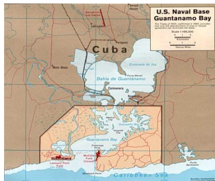
Map of U.S. Naval Base, Guantanamo Bay